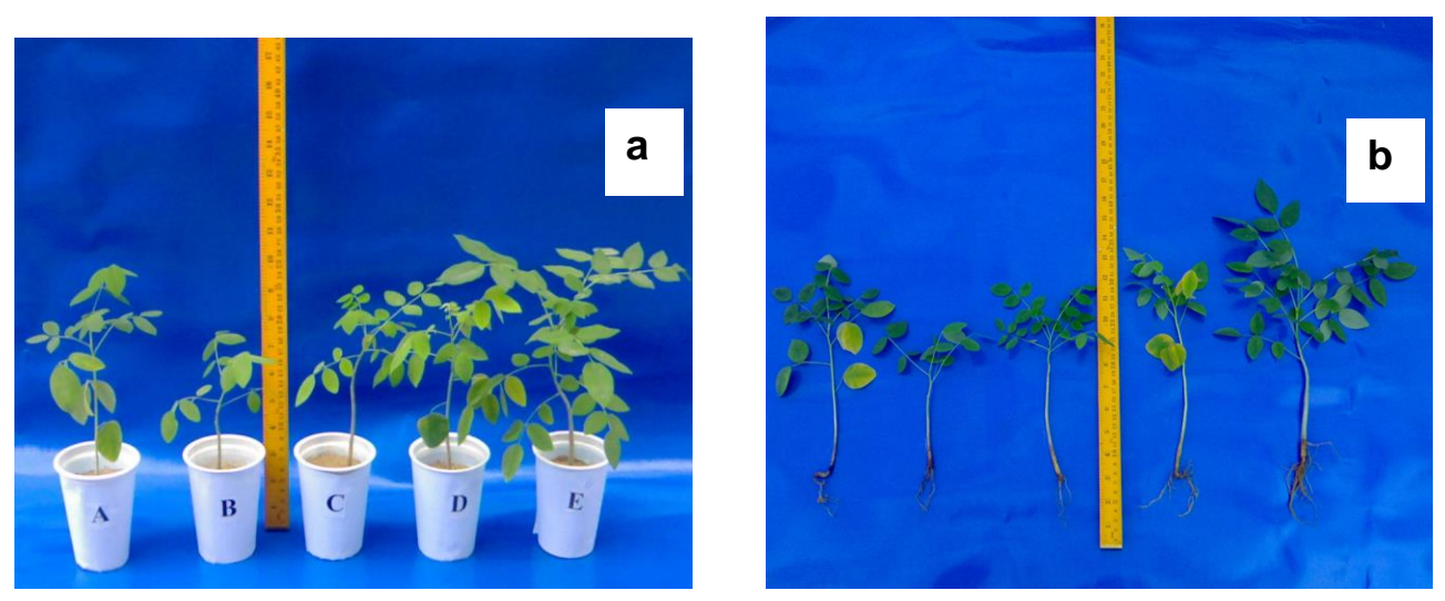
Figure 1: Growth of Geliricidia sepium in different soils (a) and after harvest (b)Sites: A = Karachi University Campus soil; B = Indus Battery factory soil; C = Universal Chemicals factory soil; D = Haroon Textile factory soil; E = National Foods Ltd. Factory soil